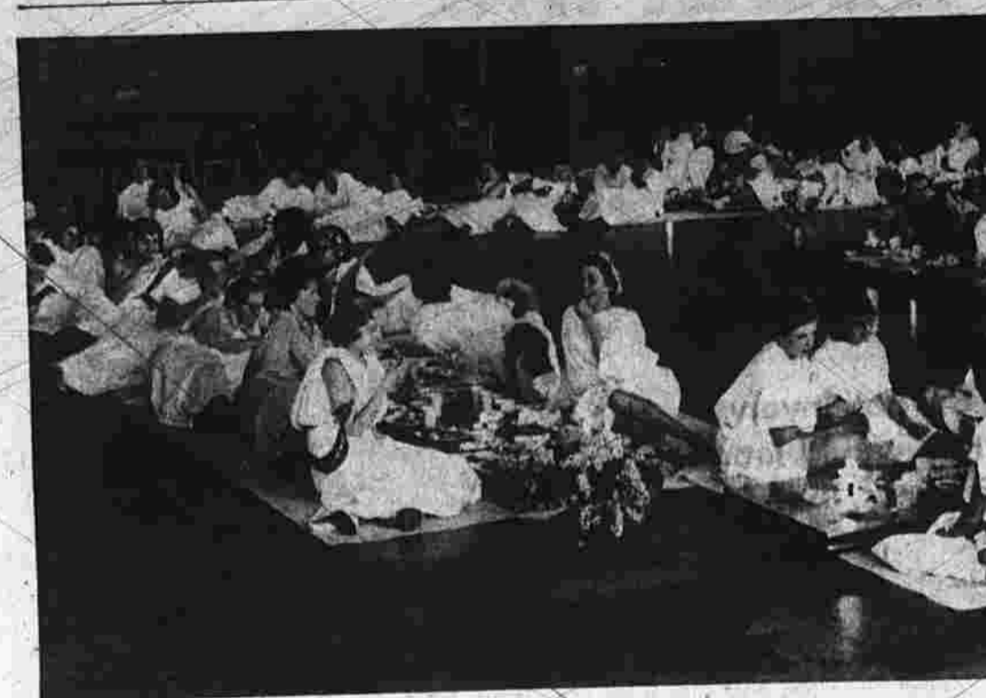
Latin Clubs dine 'at length' at Annual Roman Banquet

Compiled by Students of Manchester High School