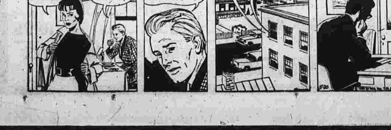
THE STORY OF MARTHA WAYNE