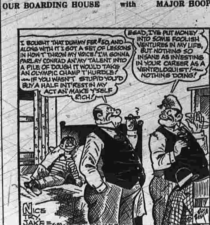
OUR BOARDING HOUSE